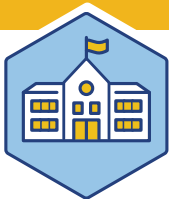
Prop B General Proposition