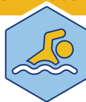
Prop E Aquatic Centers