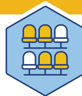
Prop F Stadiums