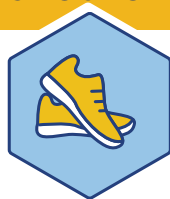
Prop D Athletics & Recreation