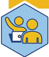
Prop A VATRE