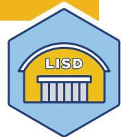
Prop G Indoor Multi-Purpose Facilities