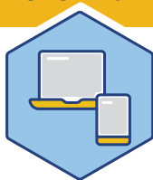
Prop C Technology